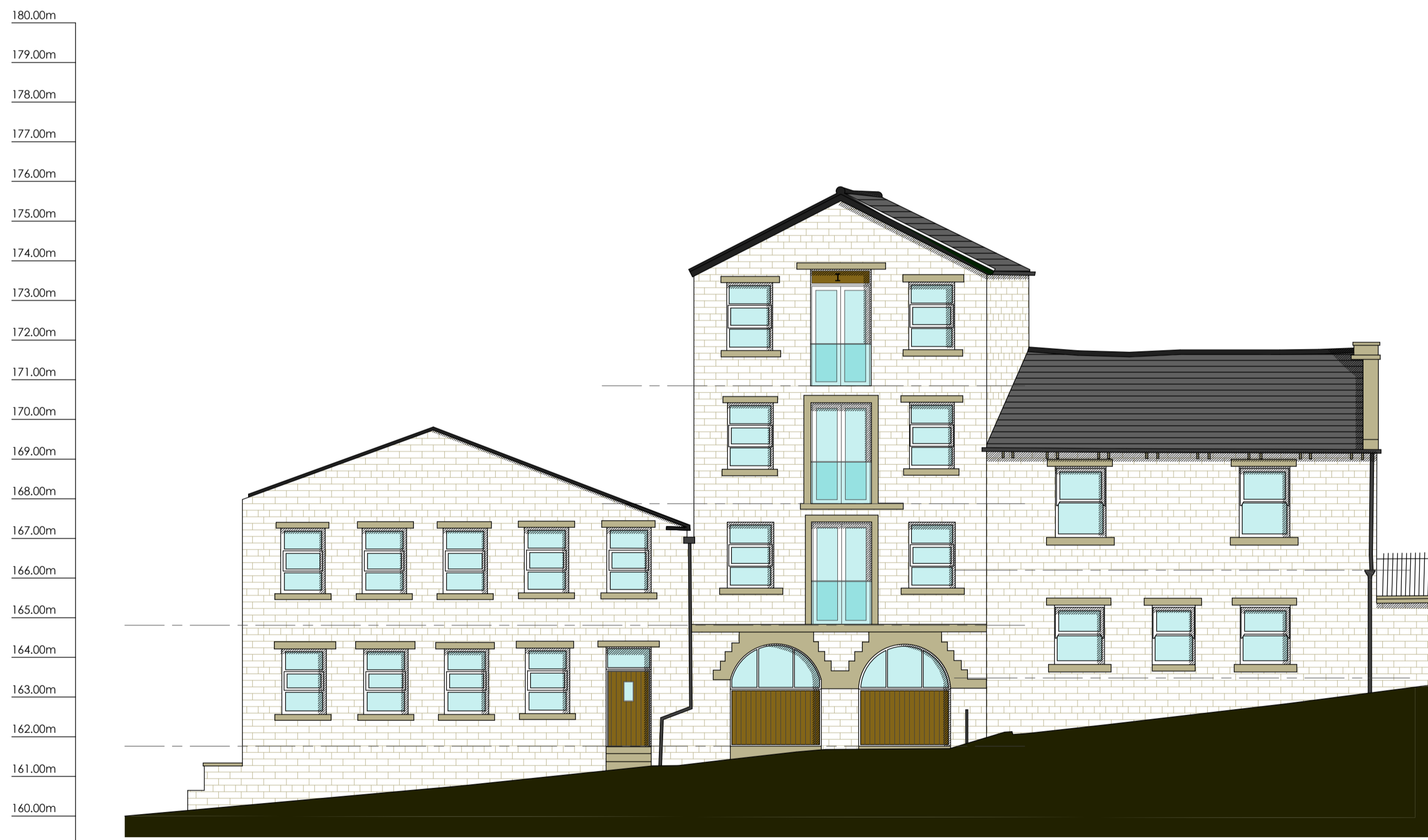
Elevation Ref. AE1