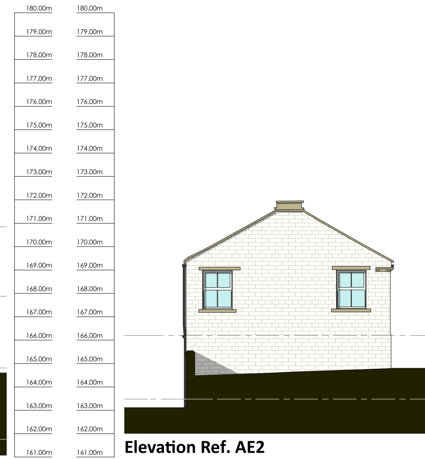
Elevation Ref. AE2