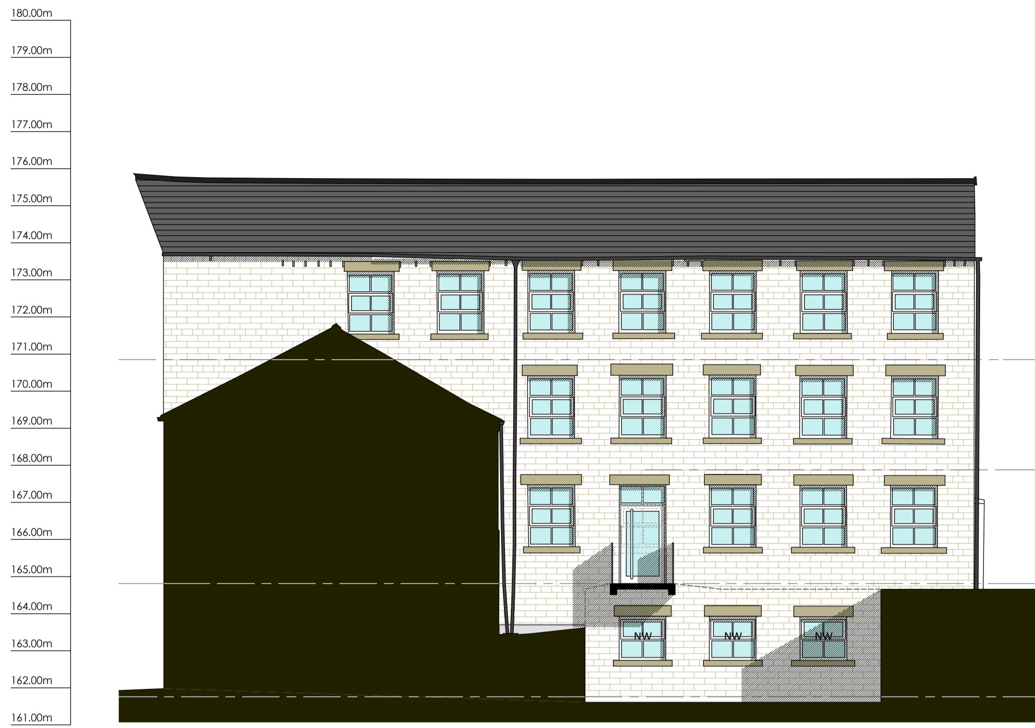
Elevation Ref. AE4