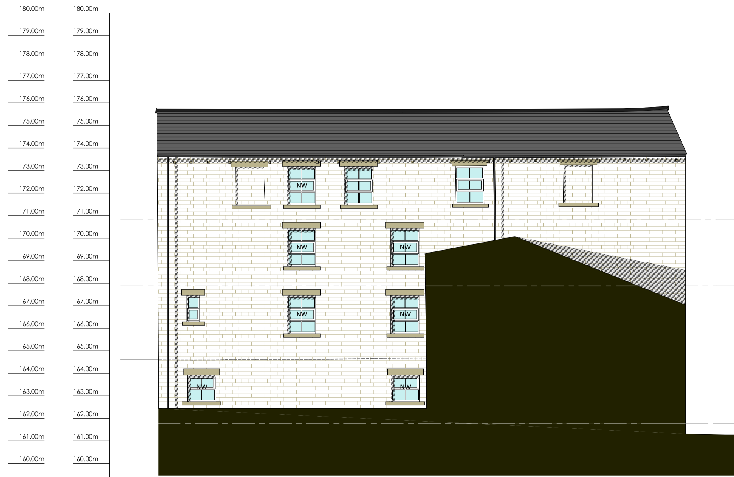
Elevation Ref. AE6

COPYRIGHT RESERVED © THIS DRAWING IS COPYRIGHT AND THE INTELLECTUAL PROPERTY OF LOROC ARCHITECTS LIMITED. THIS DRAWING MAY NOT BE REPRODUCED IN WHOLE OR IN PART WITHOUT WRITTEN AUTHORITY. DO NOT SCALE NO DIMENSIONS TO BE SCALED FROM THIS DRAWING. ALL DIMENSIONS TO BE CHECKED ON SITE PRIOR TO COMMENCEMENT OF WORKS AND ANY DISCREPANCIES REPORTED TO THE ARCHITECT / ENGINEER / CONTRACTOR ALL INFORMATION ON THIS DRAWING IS SUBJECT TO A FULL AND COMPREHENSIVE TOPOGRAPHICAL SURVEY AND CONFIRMATION OF RELEVANT TITLE. ADDITIONAL NOTES ALL WORK TO BE CARRIED OUT IN ACCORDANCE WITH THE BUILDING REGULATIONS AND THE REQUIREMENTS OF THE LOCAL AUTHORITY ADDITIONAL COMMENTS DENOTED ON DWG AREA AS (CDM)