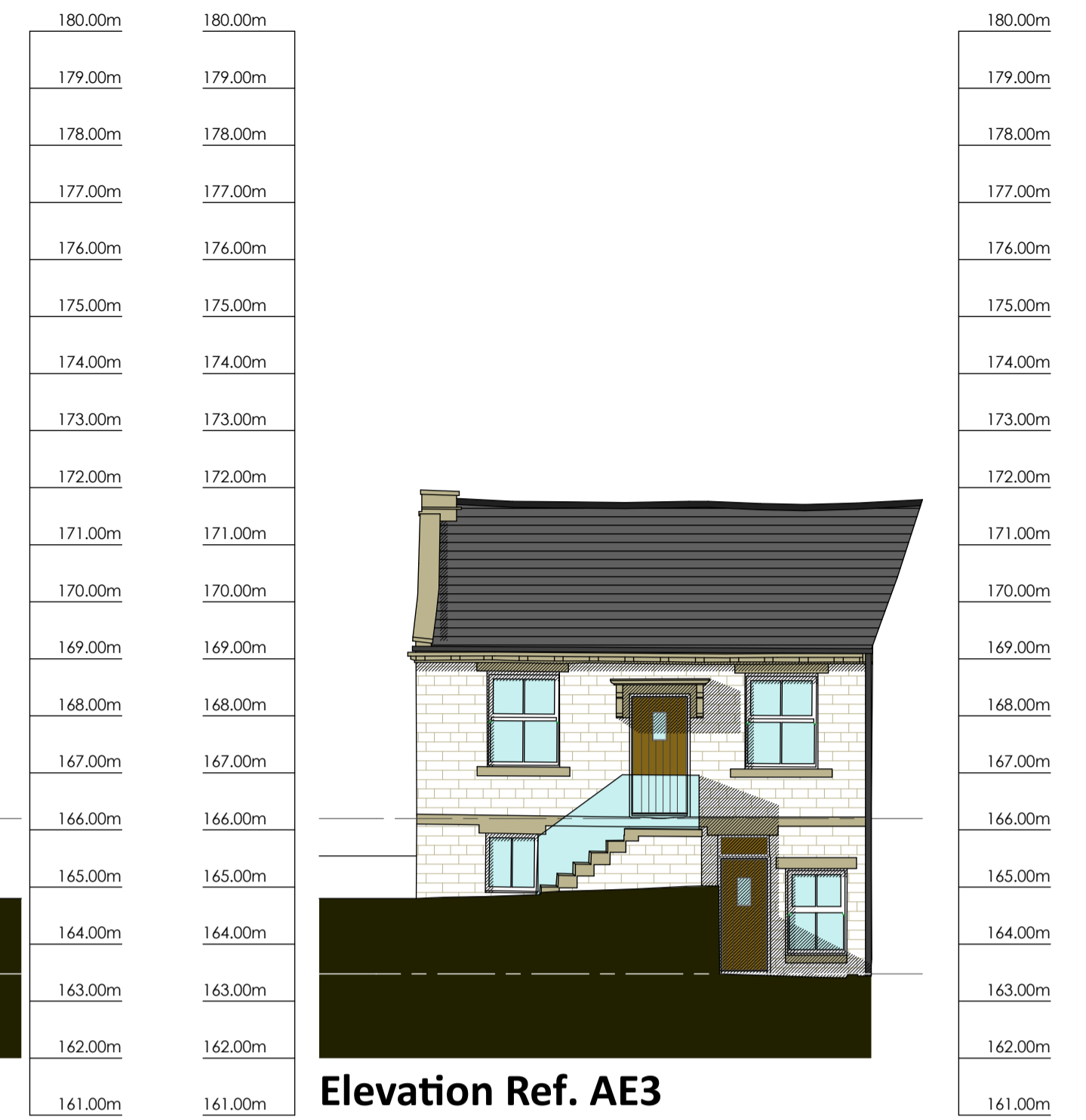
Elevation Ref. AE3