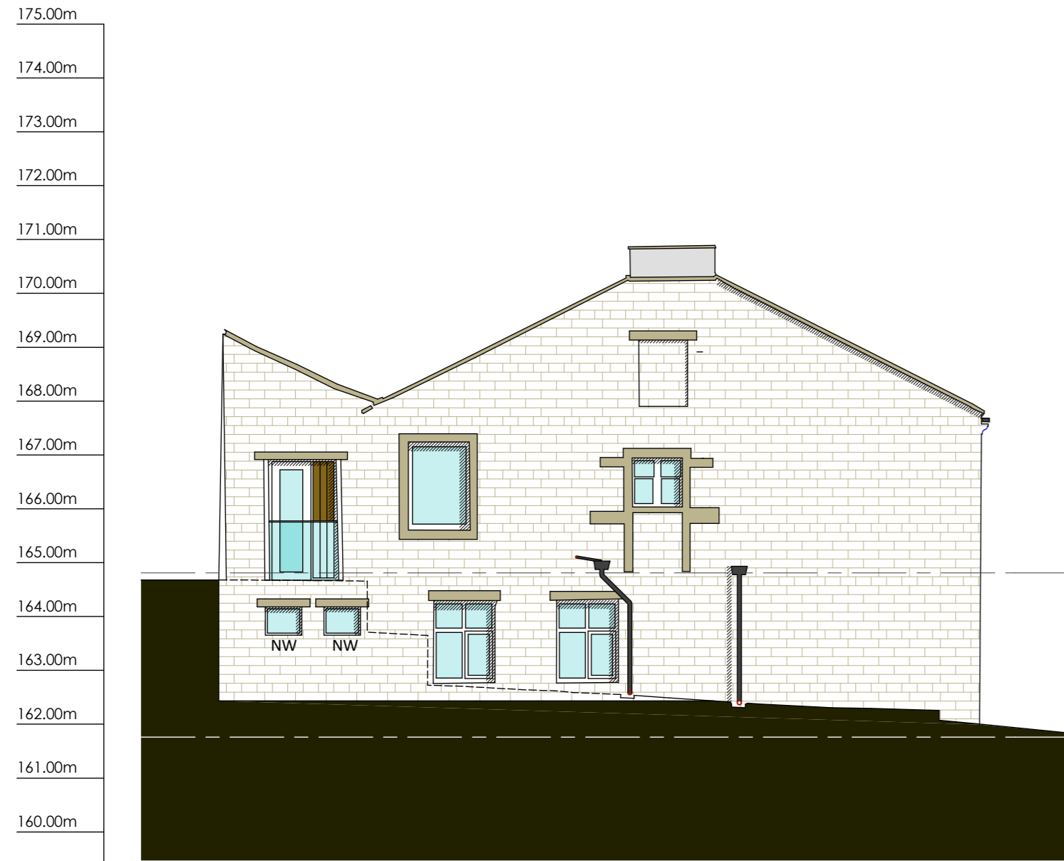
Elevation Ref. AE7

ALL WORK TO BE CARRIED OUT IN ACCORDANCE WITH THE BUILDING REGULATIONS AND THE REQUIREMENTS OF THE LOCAL AUTHORITY.