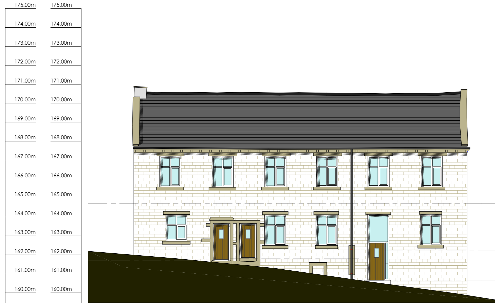
Elevation Ref. AE8