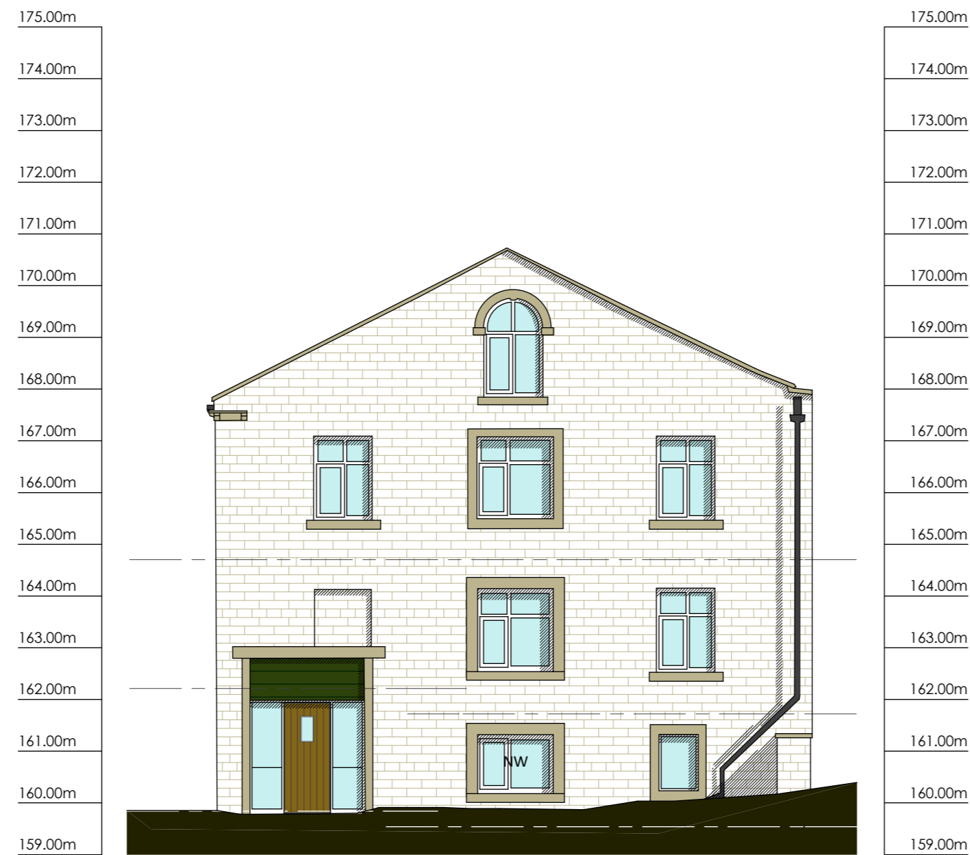
Elevation Ref. AE9