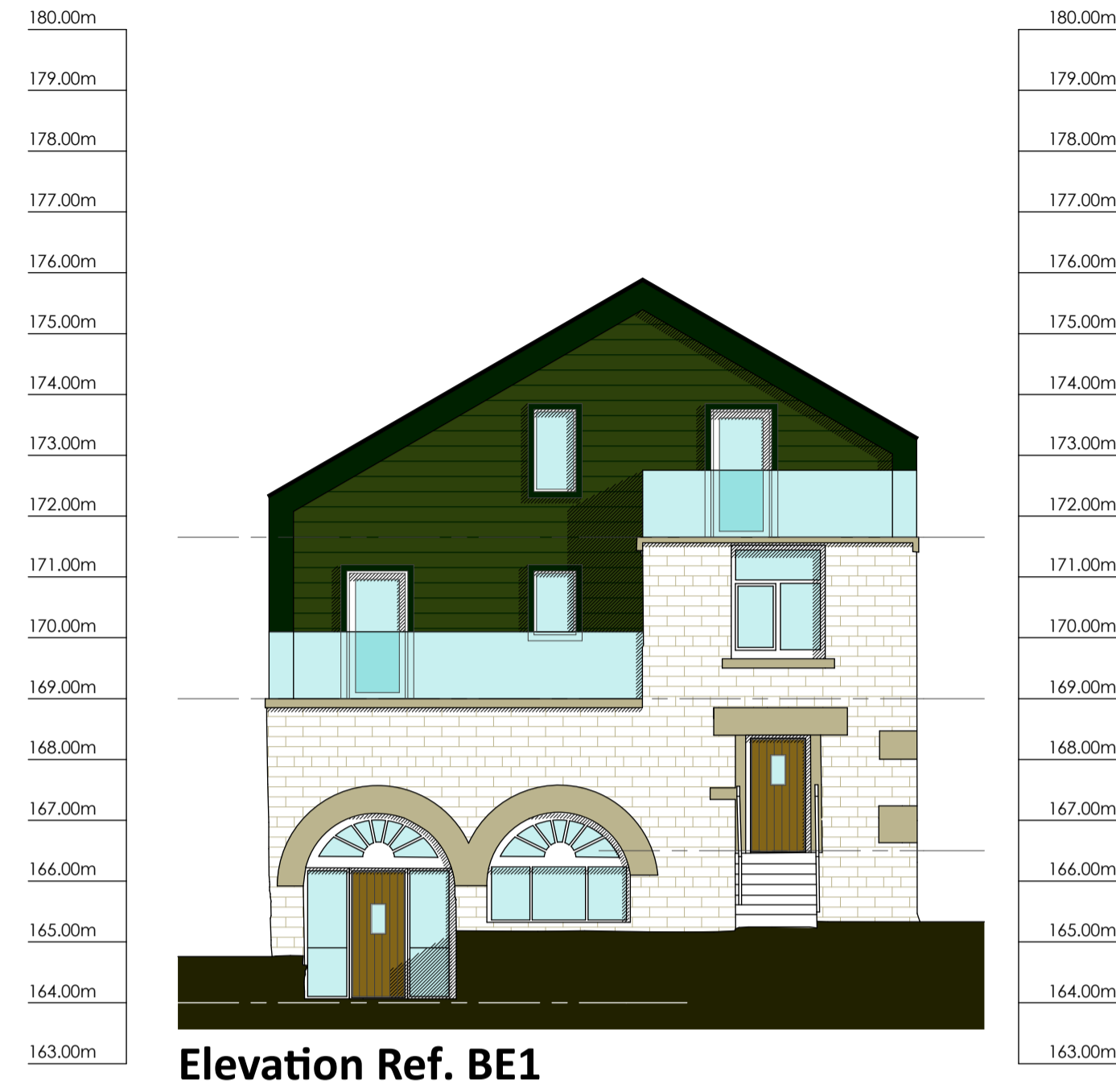
Elevation Ref. BE1