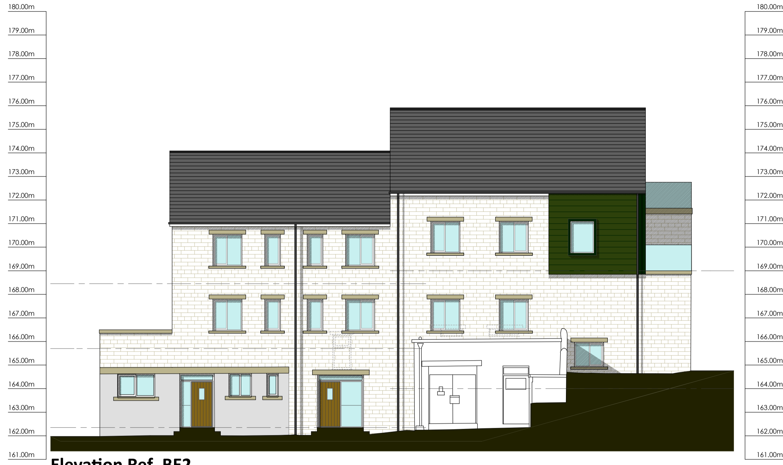
Elevation Ref. BE2