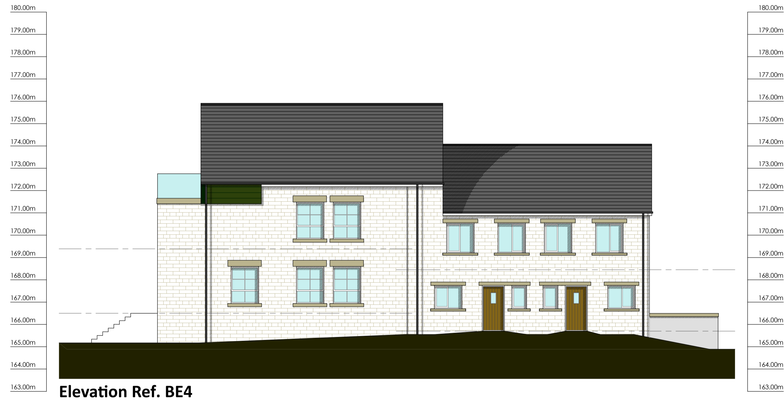
Elevation Ref. BE4